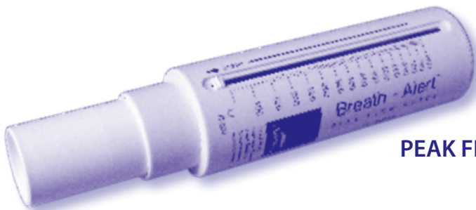
PEAK FLOW METER